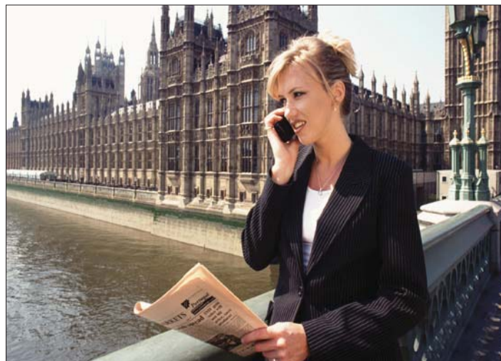
Tellabs supplies wireless providers worldwide with reliable and scalable mobile backhaul solutions.