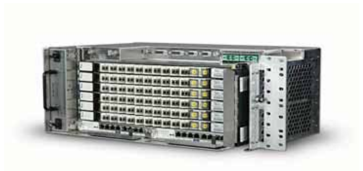
The Tellabs 7100 Nano™ OTS port shelf with 6 interface modules